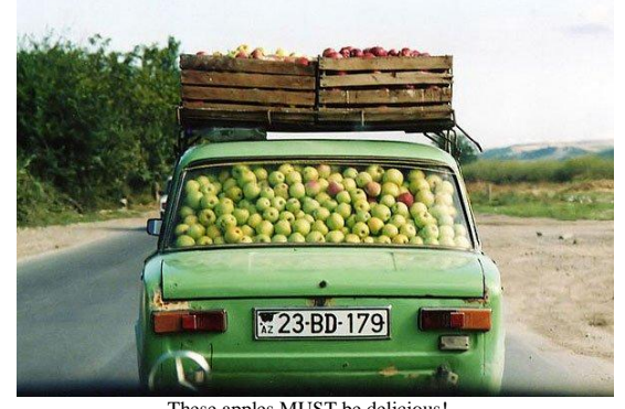
These apples MUST be delicious!

It will be 'apple time' in Bolzano (Italy) when the Novice and C categories swarm in to open the Starclass season from Oct. 19<sup>th</sup> to 21<sup>st</sup>. No Ipads for free but delicious fruit for all tastes from Sudtirol!