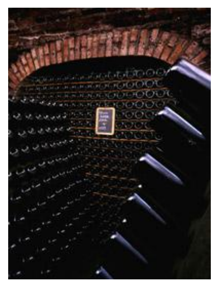
Champagne cellars in the region can hold as many as 3.5 MILLION bottles!