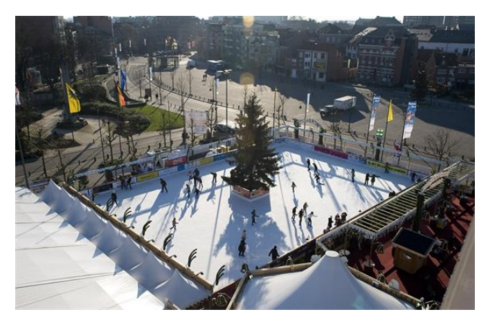
One of the highlights of WINTERLAND HASSELT is the ice rink!

From Nov. 17<sup>th</sup> to Jan. 6<sup>th</sup>, 'Winterland Hasselt' will bustle with festive events and will host for the first time Santa's home, a