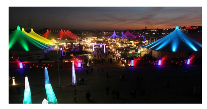
Munich Christmas Market by night

10 days to Christmas and the last shopping frenzy at the Munich 'Marktes der Ideen', a Christmas village with over 200 stalls for all tastes and pockets! The Junior C and Novice will love this when visiting Munich for their second Starclass appointment from Dec. 14^{\text{th}} to 16^{\text{th}} .