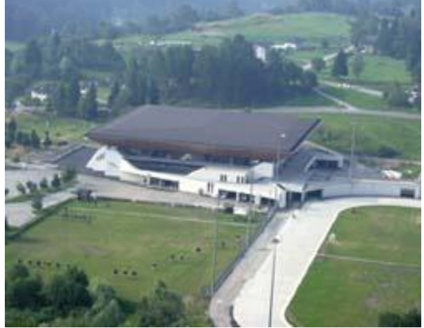
The ice-rink in Piné in summer.

From the Netherlands south to Italy, where the season had started; the top 8 skaters from each category will meet their counterparts, qualified from the Danubia series, in Baselga di Piné from March 15<sup>th</sup> to 17<sup>th</sup>. The Piné Plateau scattered with crystal clear glacial lakes contoured by forests and valleys, will become home for skaters,